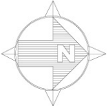
1A PROPOSED SITE PLAN 1" = 20'-0"

1.86 ACRES WARD 23 SECTION 7 BLOCK 975 LOT 1 CURRENT ZONING - M/3 PROPOSED ZONING - R/R